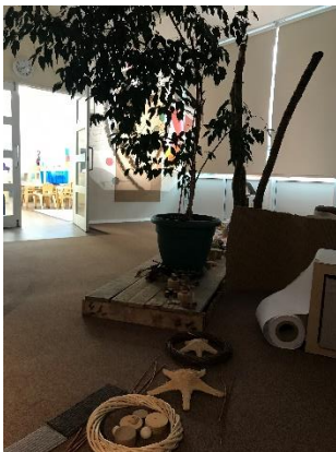
The training inspired a re-imagined classroom space at Whitnash

And the need for children to be encouraged to explore and given time and freedom to ask questions and find answers.